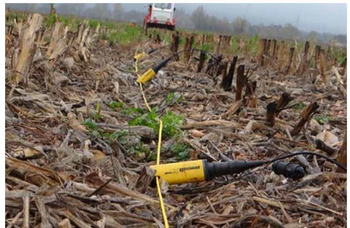
Field deployment for High-Resolution Vibro-Seis Survey