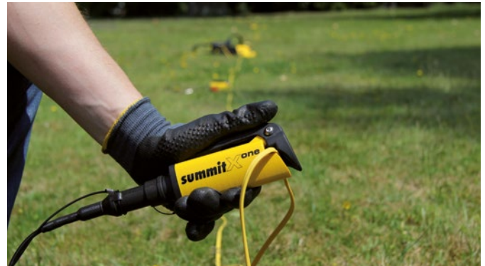
SUMMIT X One Snap-On Connector